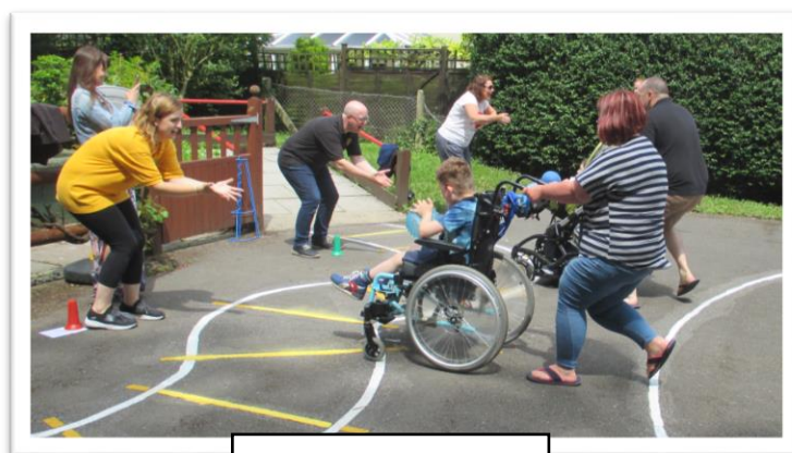
Sports Day 2019

Over the course of the year there are a number of whole school events to which parents are invited, which are always enjoyed by all.