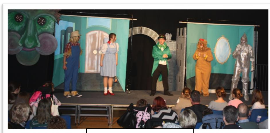
Staff Production 2019

A range of other professionals also visit the school to provide additional advice and support as and when required. As an example, medical professionals regularly hold clinics at the school and these will often include consultant paediatricians, the school nurses and an array of clinical specialists, dependent on need. The school’s Education Psychologists and Specialist Teacher Advisor (Physical Disability) are also regular visitors.