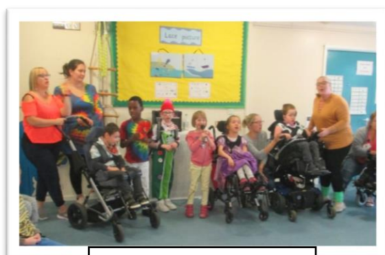
Harvest Samba 2018

“Pupils speak highly of their experiences at the school and are proud to be members of their “family school”. They rightly believe they are very well cared for because their individual needs are considered in all aspects of the school’s work” (Ofsted June 2016)