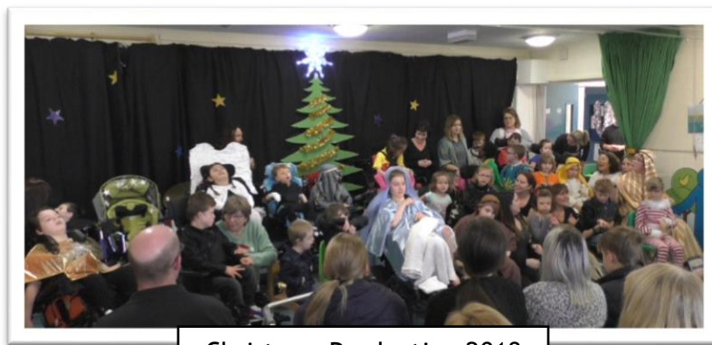
Christmas Production 2018

At Saxon Wood, we pride ourselves in developing modern and bespoke provision for children with multisensory and complex medical needs. Staff in our sensory classes are experienced in working alongside children with a range of sensory needs including visual, auditory and multisensory impairment as well as those with PMLD. Our staff are highly trained in utilising multichannel communication strategies such as Eyegaze, Objects of Reference, Makaton, hand-on-body signing and symbolic communication in order to help our children to access and understand the world around them. Modern resources such as Acheeva bed learning stations, switch adapted toys and equipment and state-of-the-art AAC allow our children to overcome daily challenges and demonstrate their progress and achievements.